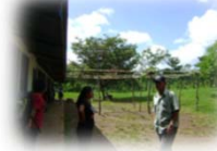
Literacy & Health