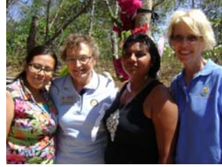
10 Delegations to MN/WI : Kairos school, community members from El Corozo