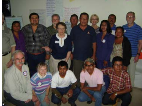
26 Delegations to Nicaragua: Steering committee, strategic planning, workshops, cultural delegations – over 60 Rotarians plus family/friends