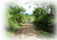
Roads & Water